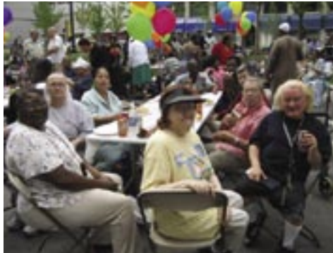
Block party guests.