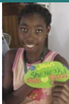
A VBS student displays a craft.

The back of the t-shirts the Roger Bacon High School kids wore for the mission trip. This one shows the products of their hard work — it is sweaty and dirty!