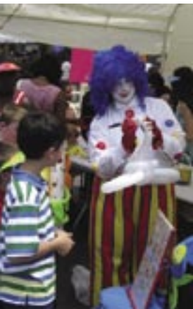
A clown makes balloon animals.