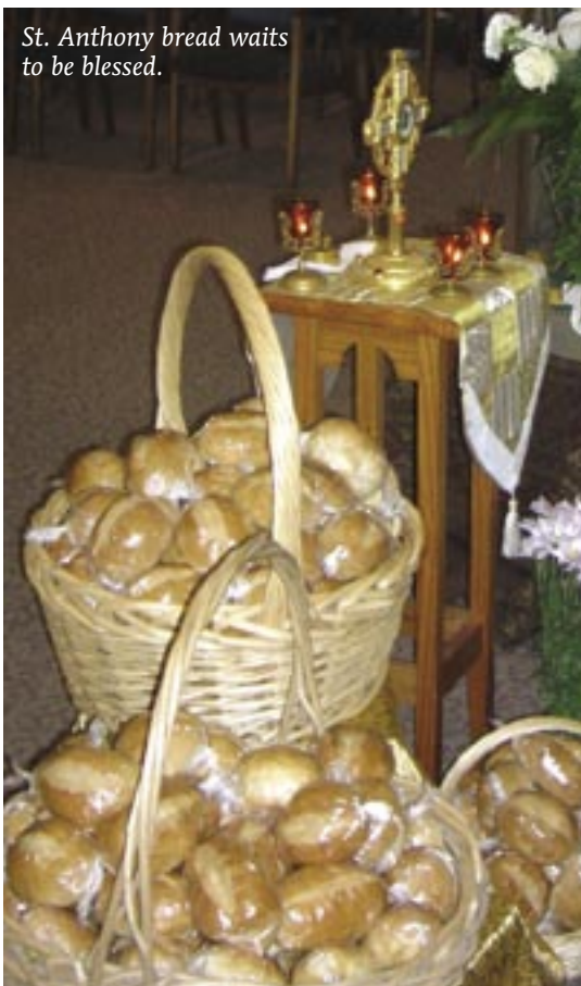
St. Anthony bread waits to be blessed.