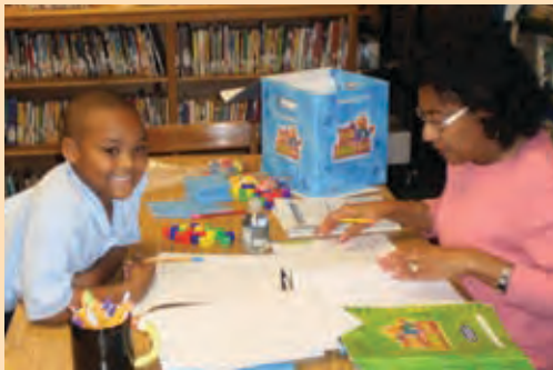
A student waits patiently while a librarian reviews his work.