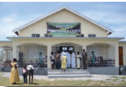
The new St. Mark Church

St. Joseph Church, Savannah-la-lamar (under the care of the Franciscans since 2000), has given birth to two faith communities, St. Mary and St. Luke. After several years celebrating Masses in primary school classrooms, 2009 marked the first time people from these two missions have their own church for proper worship. The newly constructed St. Mark Church in Grange Hill was dedicated in August, and November was the dedication of St. Luke Church in Little London. Both churches received grants from St. John the