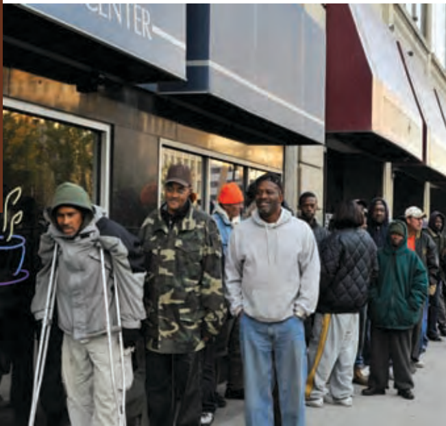
A long line of clients wait outside St. Al's Outreach Center. This vital Franciscan ministry is in jeopardy due to unavoidable Archdiocesan subsidy cutbacks.