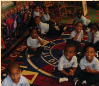
Happy pre-K students at Holy Family Catholic School.

just a short time, I was delightfully impressed by how attentive the students were with their teachers. There is a real appetite for learning!