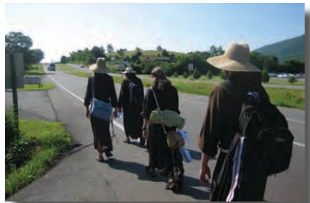
The pilgrims make their way along the road.

After walking more than 300 miles of country roads and highways, six Franciscan friars reached the Monastery of the Holy Land in Washington, D.C. on July 24. For six weeks, the friars walked from Roanoke, Virginia with only their brown habits, a small backpack for necessities and a belief in the kindness of strangers to feed and shelter them. The pilgrimage was the idea of four young friars just finishing their training and working toward taking lifelong vows. Seeking to emulate the wanderings of their founder, Saint Francis of Assisi, they journeyed together as a fraternity, ministering to one another and to strangers, while depending on God for every meal and place to sleep. Read about their journey at www.friarwalk.com .