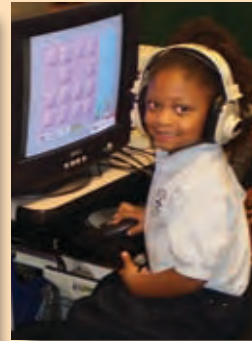
A Holy Family Catholic School student works at a computer provided by Mission Office funds.